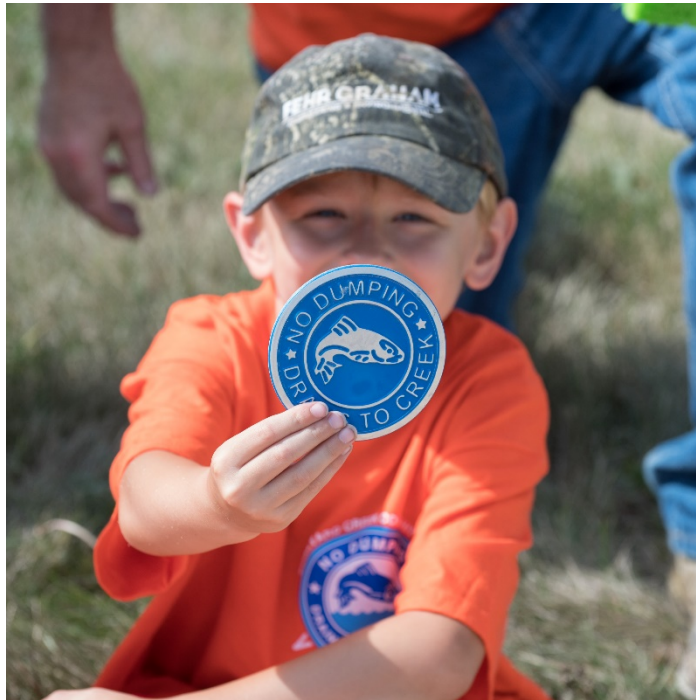
Volunteer Installs a Storm Drain Medallion