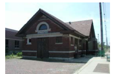
7. / Station Theatre/Railroad Depot - built - 1889. The station was built in 1889 by the Big Four Railroad Company, later known as the Peoria and Eastern Railroad and New York Central. For several years it served as a VFW post before being converted into a theatre in 1967.