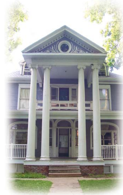
The Gus Freeman House, 504 West Elm Street, West Urbana