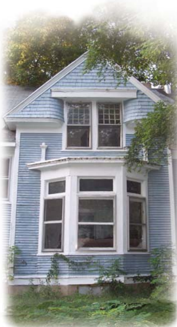
The Mary Lloyd House, 210 South Grove Street, East Urbana