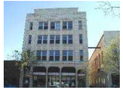
▼ Tiernan's Hall, 115 W. Main Street Built in 1871 with façade designed by Joseph Royer in 1913