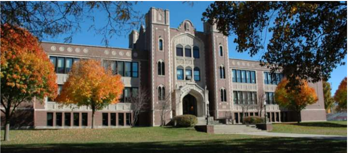
▲ Urbana Senior High School, 1002 S. Race Street