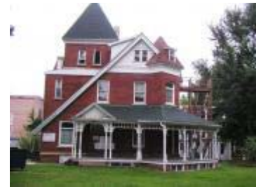
▲ Sutton House, 502 W. Elm Street Local landmark