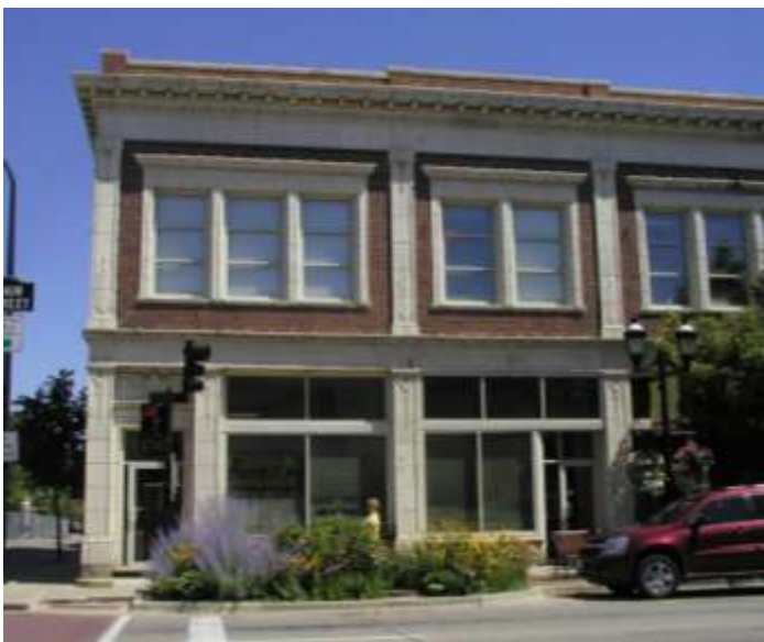
▼ 136 West Main Street