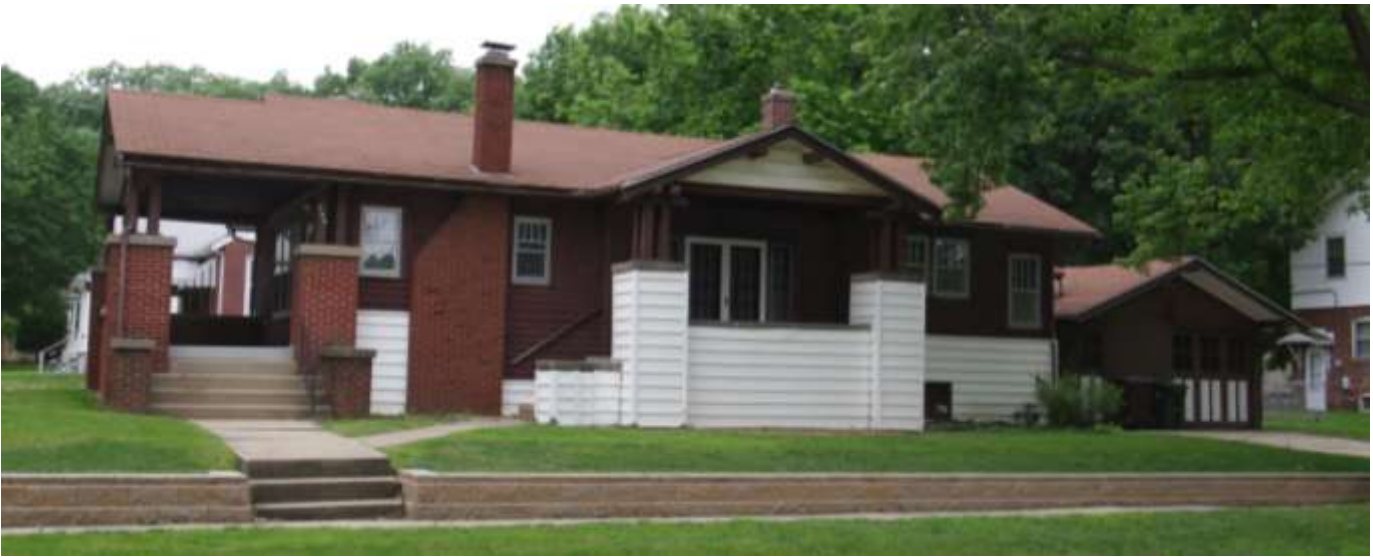
▲ 701 North Coler Avenue circa 1920 Sears House, “The Osborne”