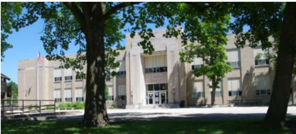
◀ Leal School, 312 W. Oregon St.