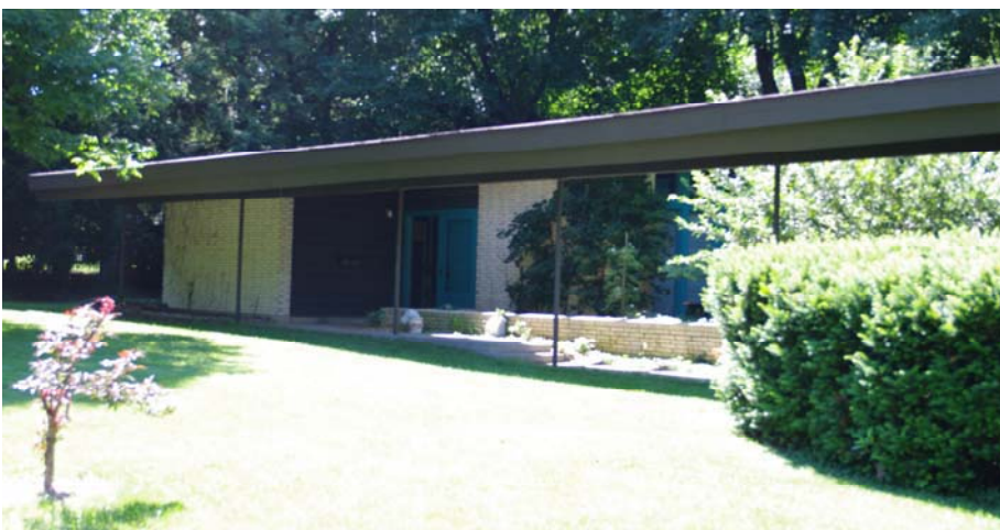
▲ 1806 Pleasant Circle