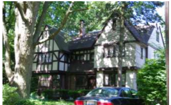
▼ 1105 South Douglas Avenue circa 1931 Tudor Revival architectural style