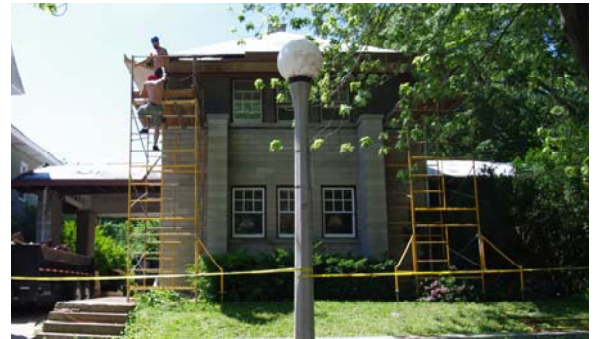
▲ 305 W. Oregon Street