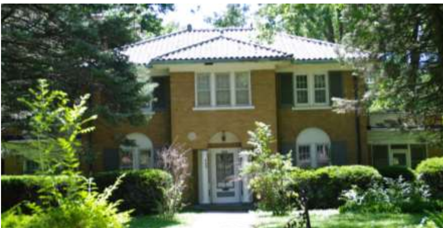
▲ 309 W. Michigan Avenue Built in 1925 in the Mediterranean architectural style