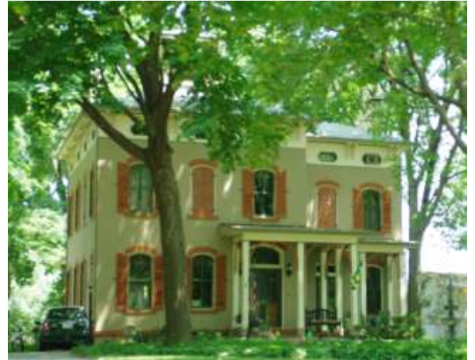
▲ 804 W. Main Street