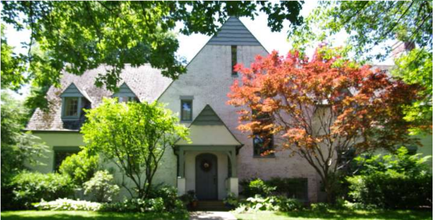
▲ 601 West Delaware Avenue circa 1933 French Revival