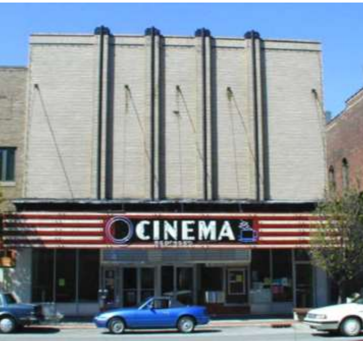
▲ Cinema Gallery, 120-124 W. Main Street