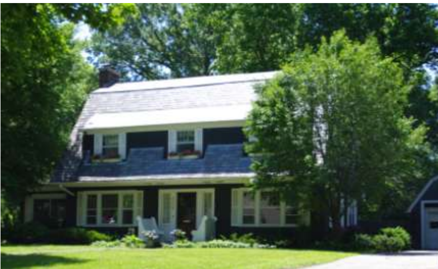
▲ 805 W. Michigan Avenue