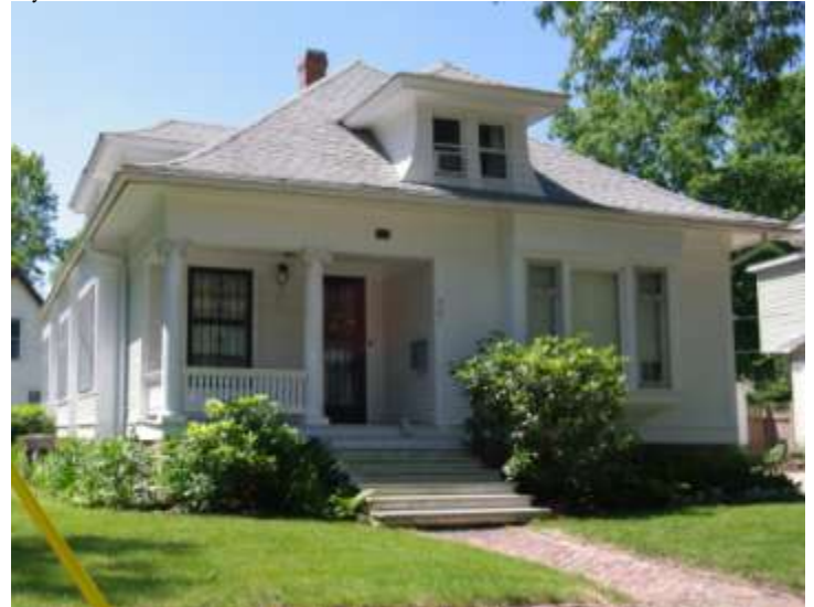
▲ 301 W. Oregon Street