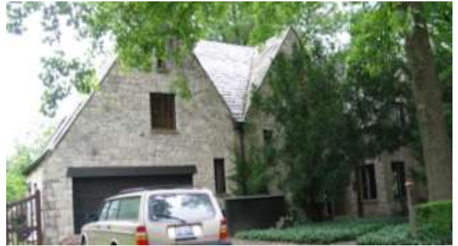
▲ 1306 South Carle Avenue circa 1927