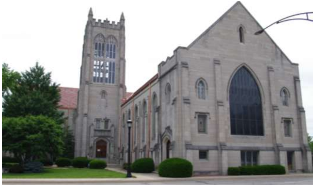
▼ St. Patrick's Roman Catholic Church, 710 W. Main Street