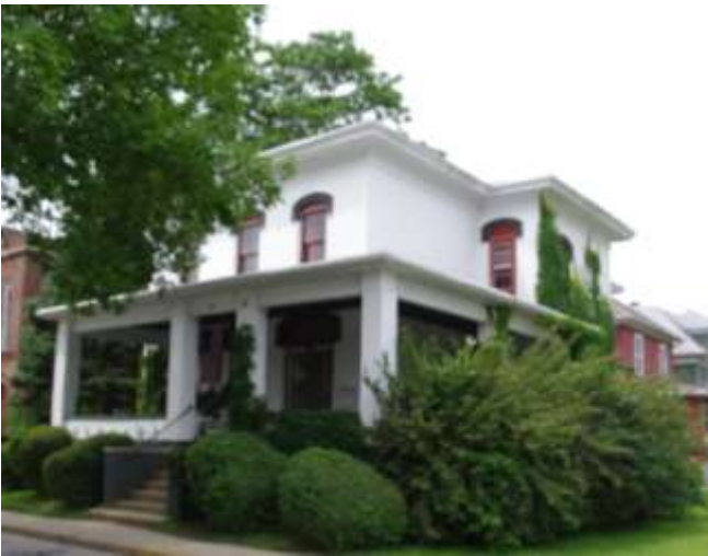
▲ Yohlen Salome Lindley Residence, 401 S. Race Street