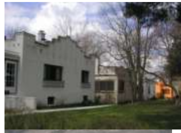
◀ Buena Vista Court 1 through 8