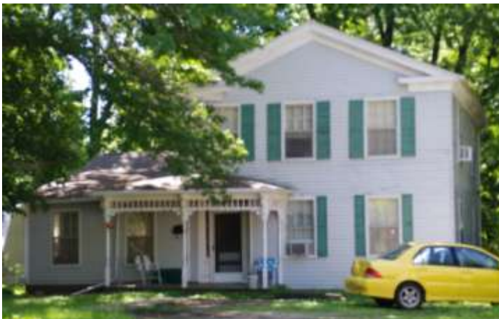
▲ 307 W. Oregon Street