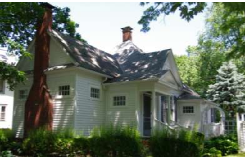
◀ 406 West Illinois Street circa 1925