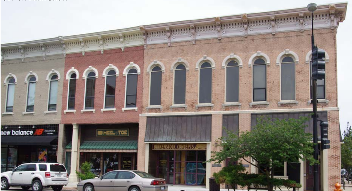
◀ 102—106 W. Main St. Built circa 1880 in the Italianate style.