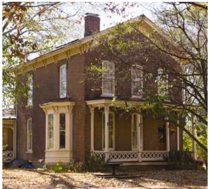
▶ Griggs House, 505 W. Main Street