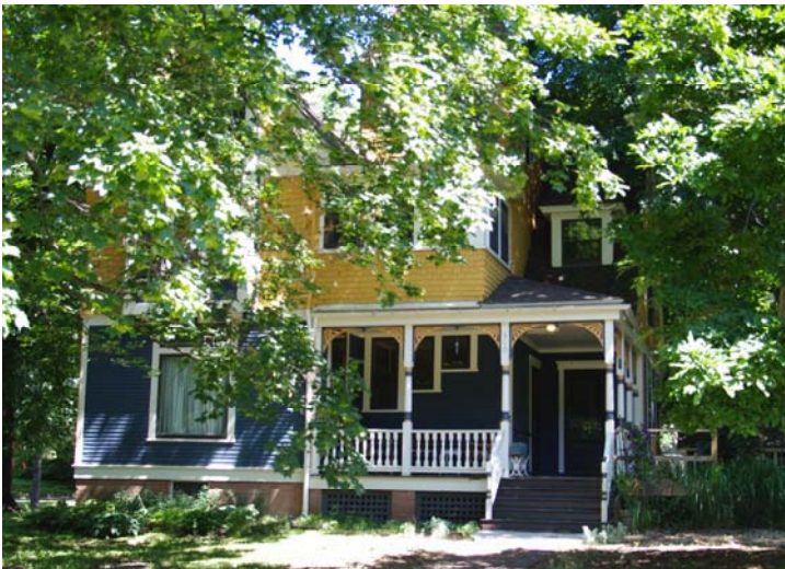
▲ Wahl Residence, 510 W. Main Street