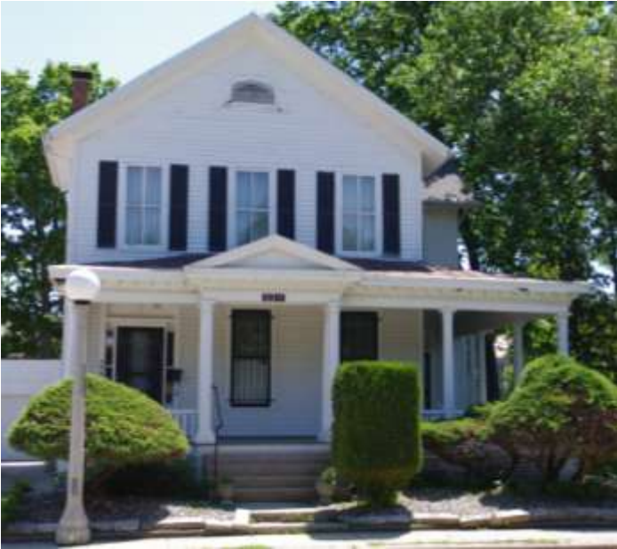
◀ 206 Cedar Street 1872