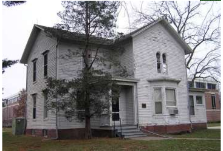
▲ Mumford House, 1403 W Loredo Taft Drive Constructed in 1870 as a model farmhouse for the University's experimental farm, Mumford House is the oldest building on campus.