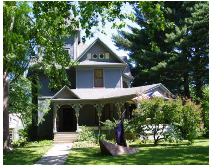
▲ Marriot Residence, 506 W. Main Street