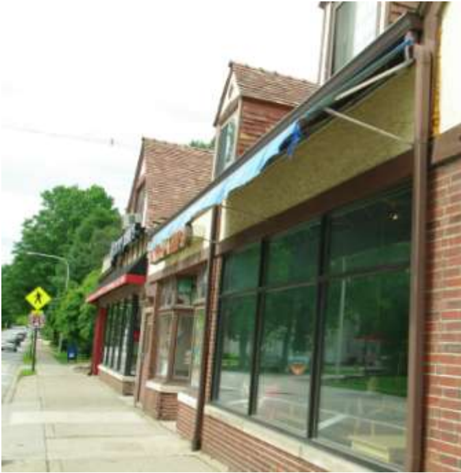
▲ 807 S Lincoln Avenue circa 1927