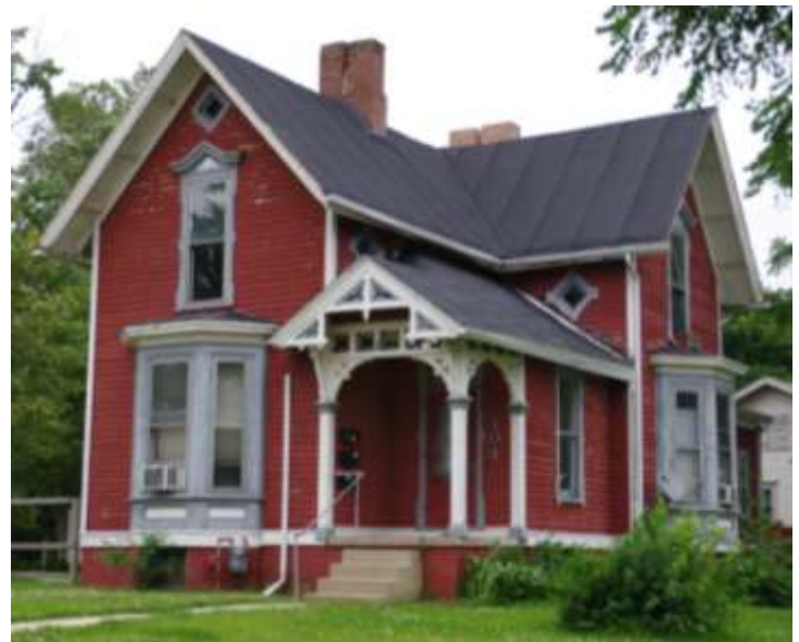
▼ Halberstadt House, 104 North Central Avenue