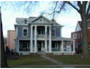
▲ 504 W. Elm Street