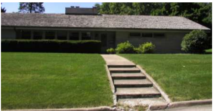
▲ Hindsley House, 1 Montclair Street