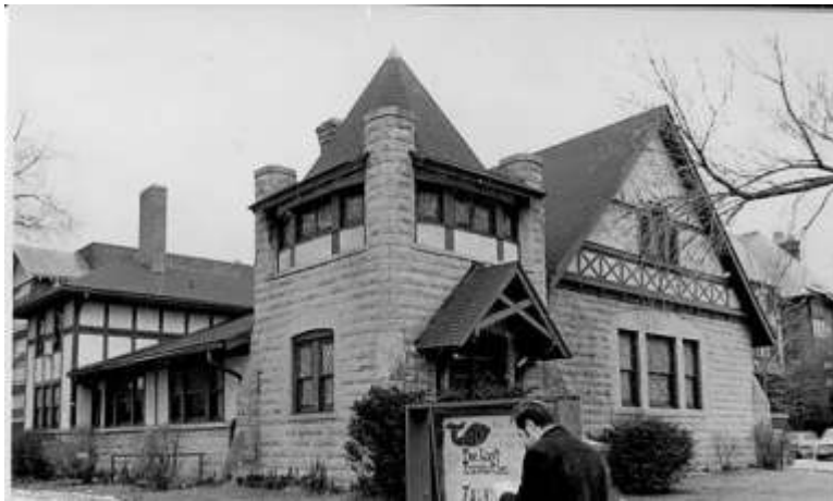
◀ Channing Murray Foundation, 1209 West Oregon Street 1920