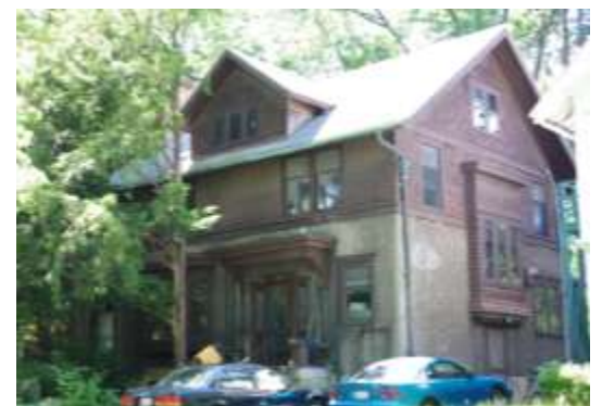
▲ 512 W. Nevada Street Built in 1925 in the Georgian Revival architectural style. The garage of this house has the original garage doors.