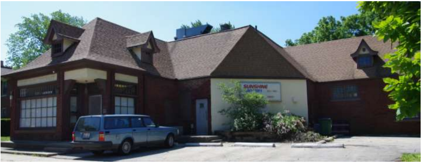
▲ Texaco Service Station, 900 S. Race Street