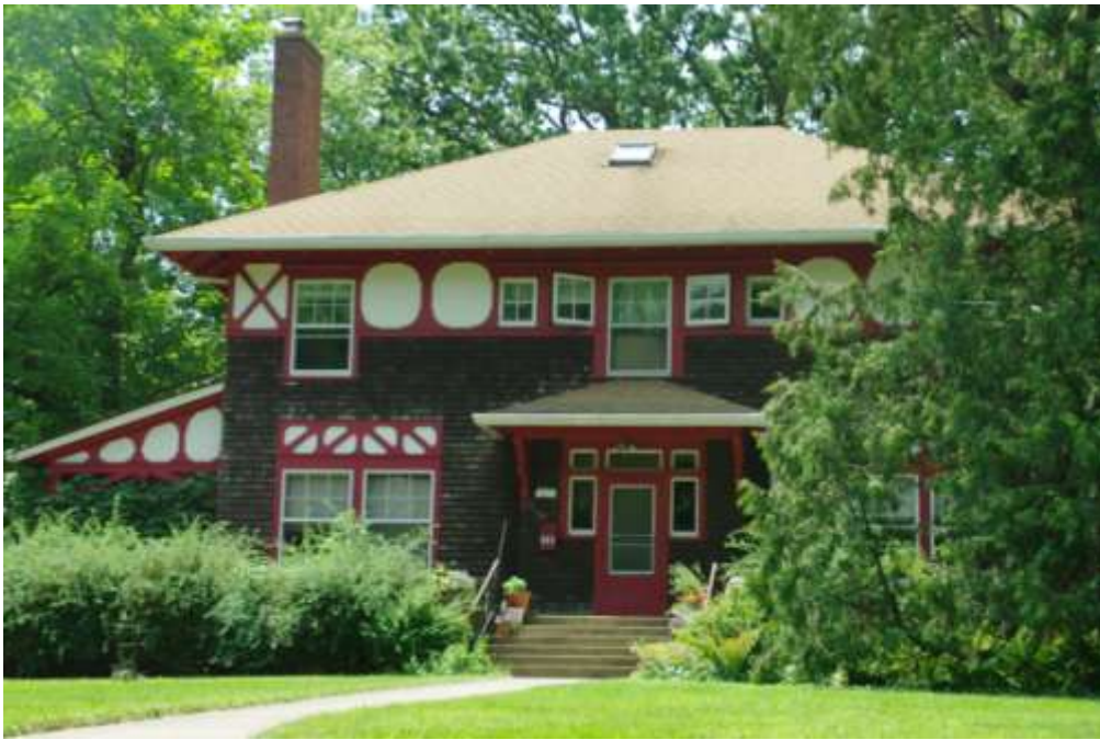
◀ 803 W. Main Street Built in 1904 for a State Senator