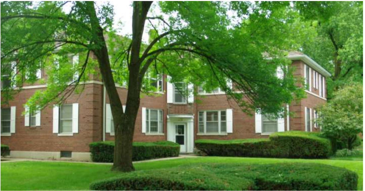
▲ Delmont Court Apartments, Located between Broadway Avenue & Race Street and Vermont & Delaware Avenues.