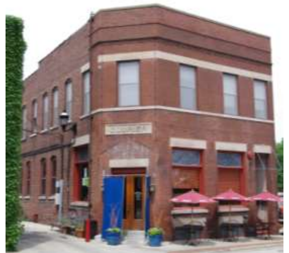
▲ Courier Cafe, 111 N. Race Street