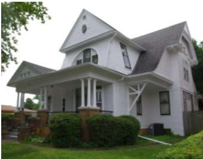
▼ Urbana Unitarian Universalist Church, 309 W. Green Street