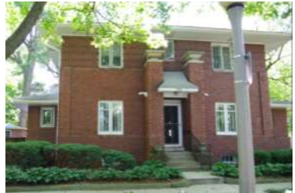
▲ 708 South Busey Avenue circa 1920 Prairie style