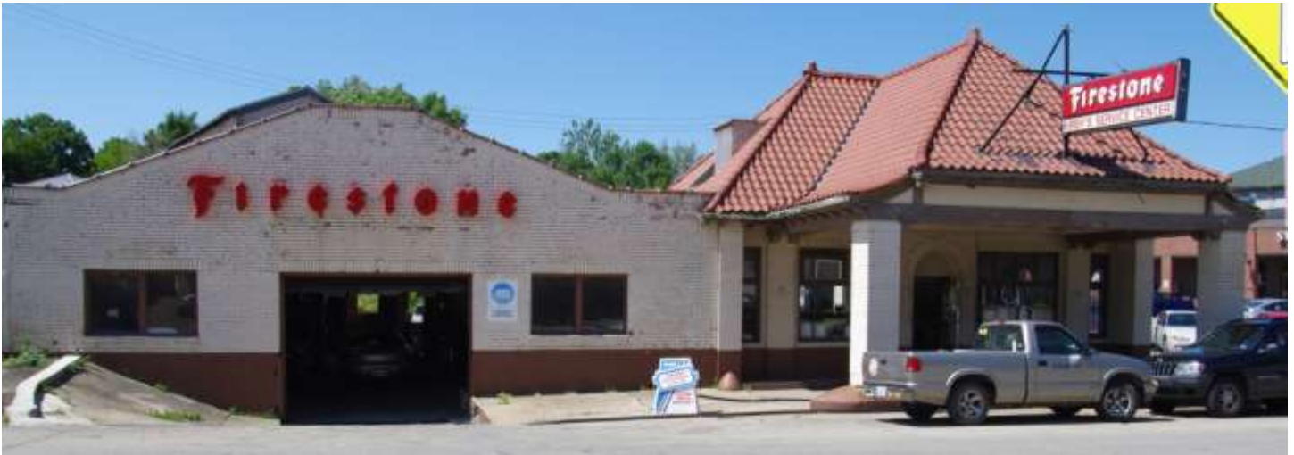
▲ Kirby's Firestone Dealer, 303 W. Main Street