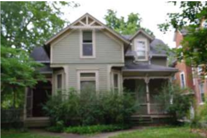
▲ 501 West Green Street 1894 Queen Anne and Stick styles