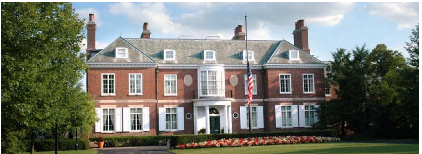
▲ President's House, Florida Avenue