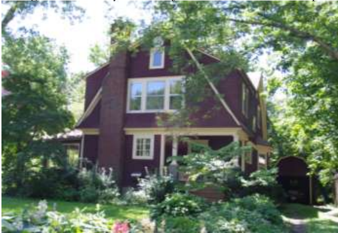
▲ 605 W. Oregon Street