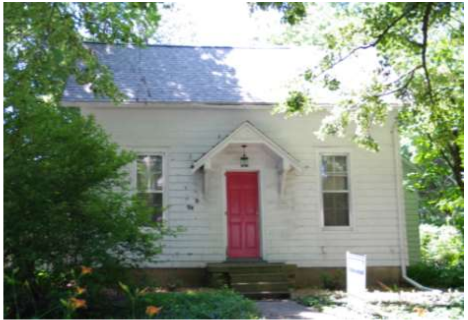
▲ 401 West High Street circa 1880