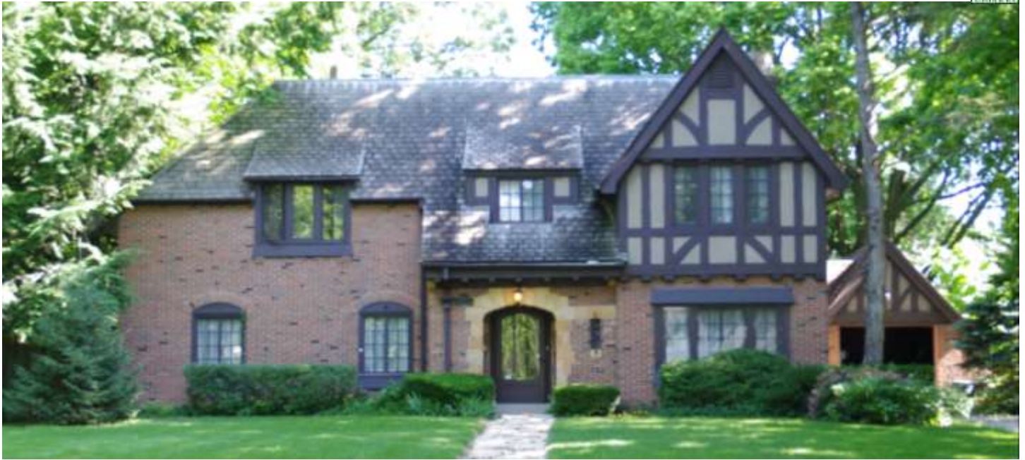
▲ 806 West Pennsylvania Avenue 1925 Tudor Revival