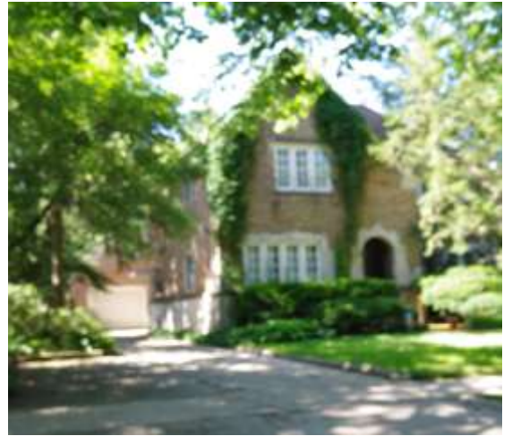
▲ 607 W. Pennsylvania Avenue ◀ 510 W. High Street Built in 1910 in the Arts & Crafts style