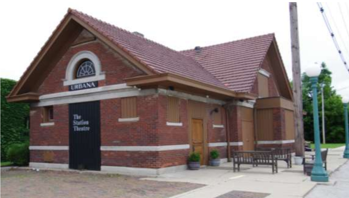
◀ The Station Theater, 223 N. Broadway Avenue