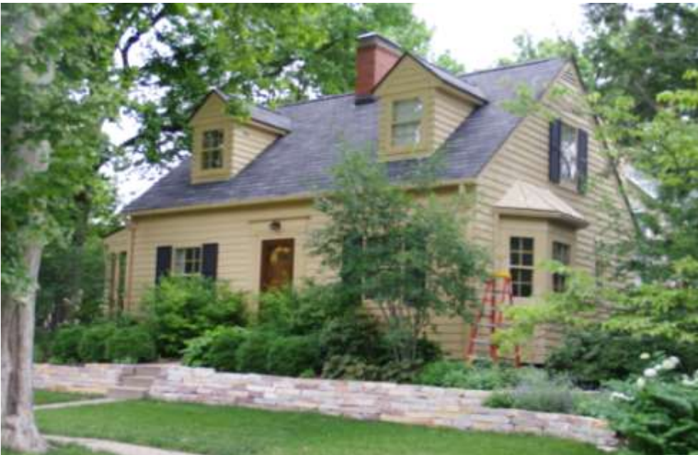
◀ 402 South Coler Avenue 1940 Cape Cod