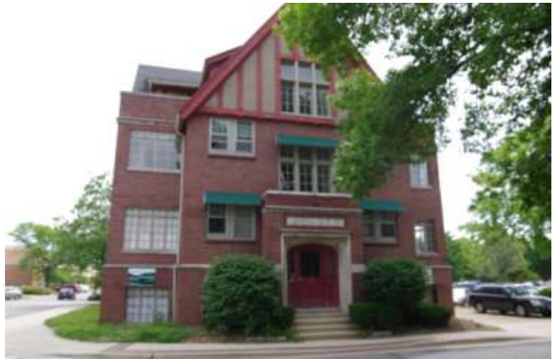
▲ 402 S. Race Street