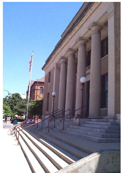
▶ Urbana Post Office, 202 S. Broadway Avenue