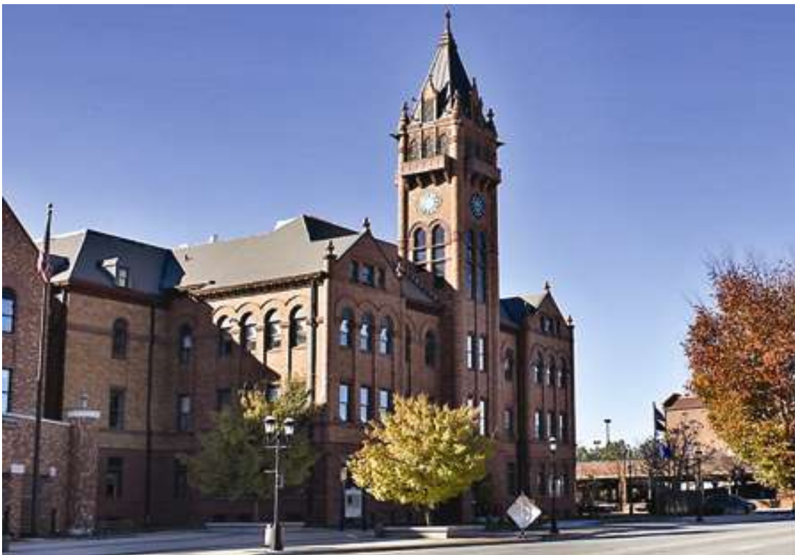
◀ Champaign County Courthouse , 101 E Main St. Built in 1898 in the Romandwque Revival style, designed by Joseph Royer.