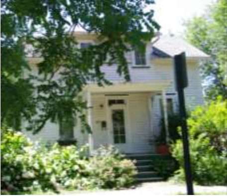
▼ 601 West High Street circa 1875