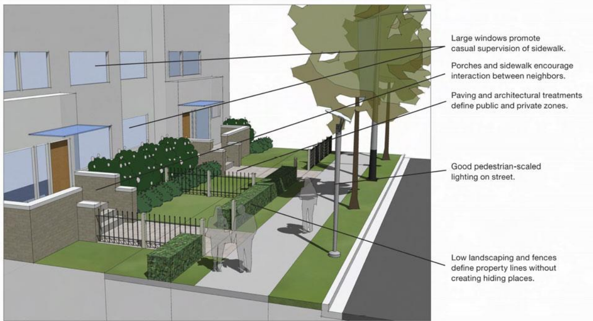
An illustration of some of the example overlay districts’ principles at work.

spaces. Building maintenance issues were addressed with additional requirements for landscaping maintenance and inspections, while pedestrian safety was promoted via requirements for increased in sidewalk connectivity. Incentives took the forms of zoning variances.