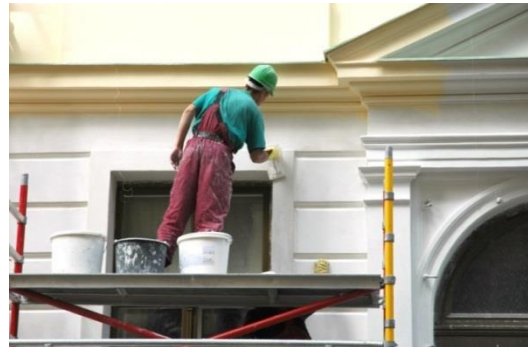
Maintenance- Preserving maintenance of buildings to protect life safety and to show someone cares about their property.