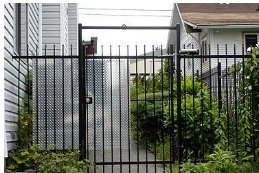
Accessibility- Limit accessibility to private property, but in a manner that preserves transparency.