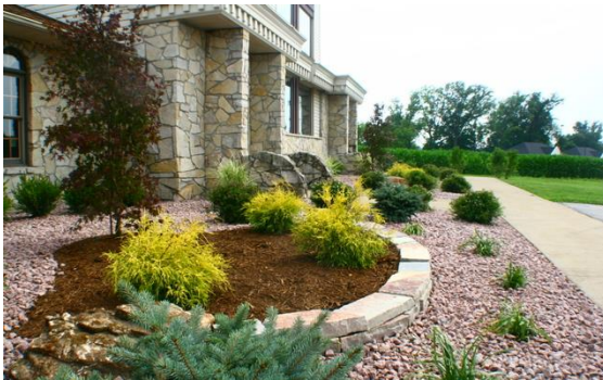
Territoriality- Separating private and public property through aesthetically appealing means.