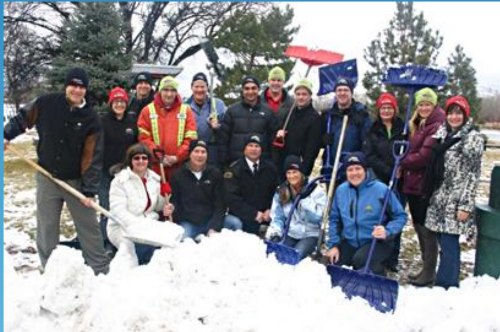
City of Kamloops, British Columbia Snow Angel Volunteers

Snow Angels are volunteers who clear snow from sidewalks, driveway entrances, and from paths to the service recipient's front door.