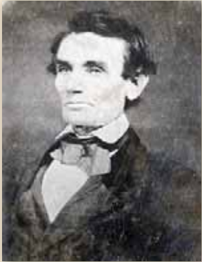
Abraham Lincoln in Urbana in 1858.