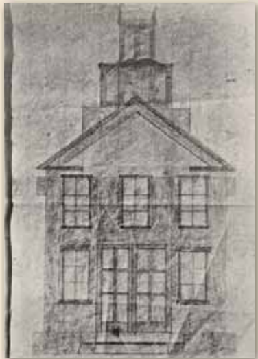
Champaign County Courthouse 1841–1858