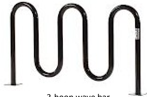
3-hoop wave bar